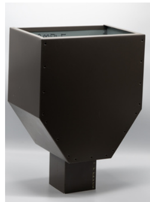
Collector Head #3