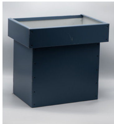
Collector Head #2