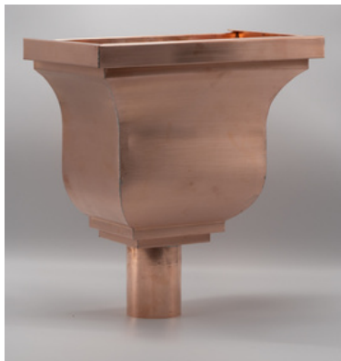
Collector Head #1

Most projects turned around in 72-hours or less, including fabrication & delivery.